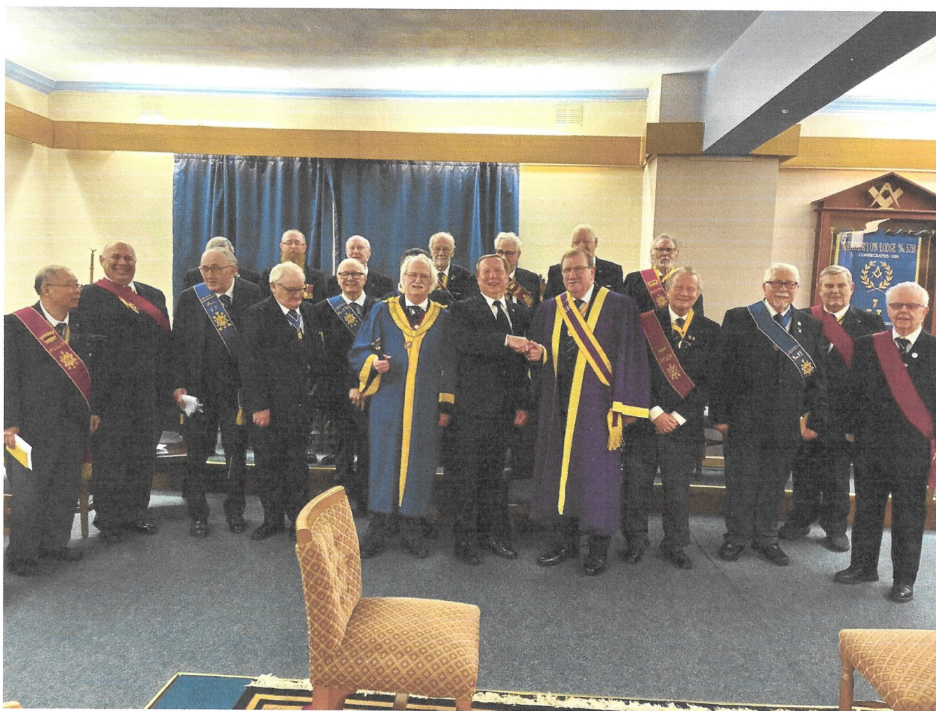
The assembled Brethren, including all four Provincial Visitors! Obviously desperate to get out and about after the Festive break. The Candidate (centre) seems to have enjoyed the experience.