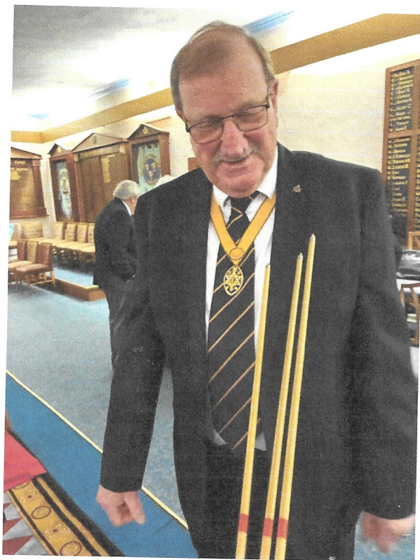
The Supreme Ruler contemplates the Points of Peril