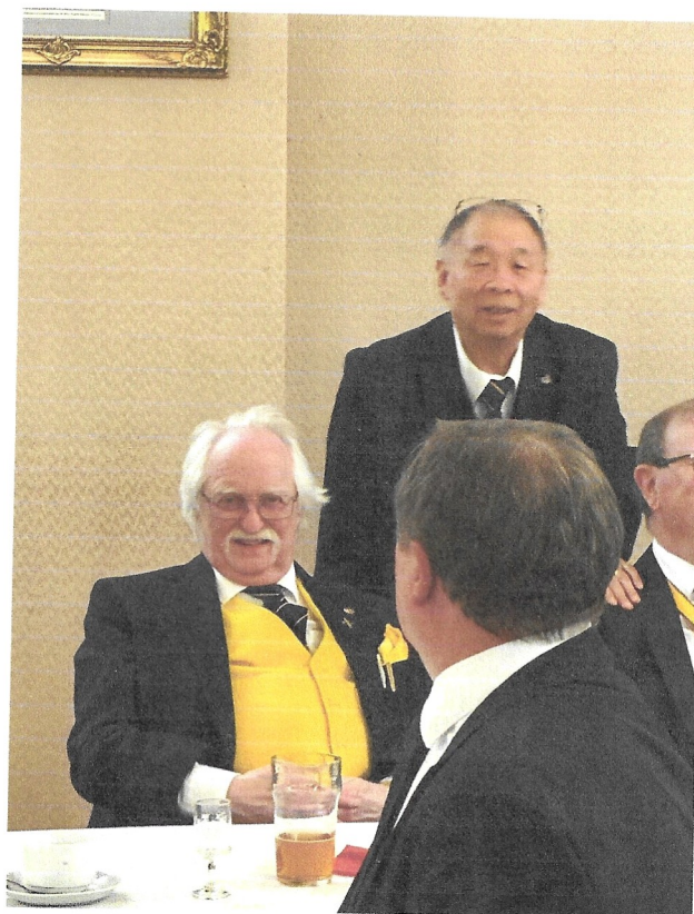
The P.G.S.R's spirit glass is empty but he seems happy enough!