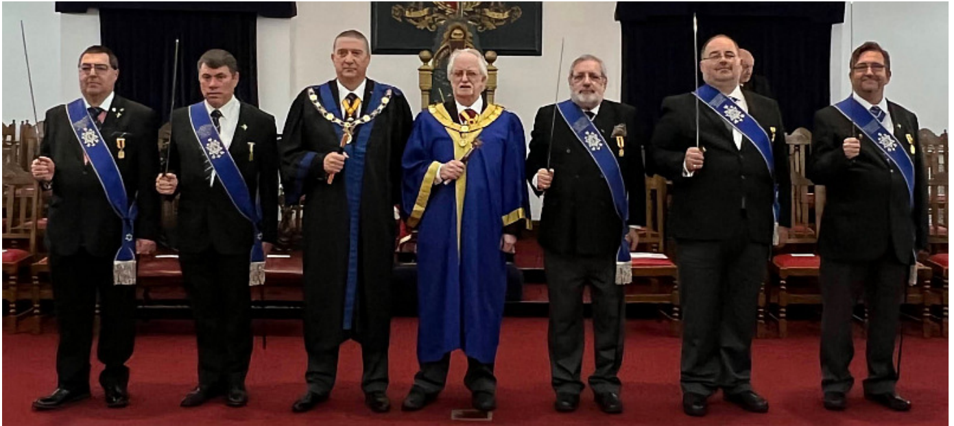
With the Provincial Arch of Steel