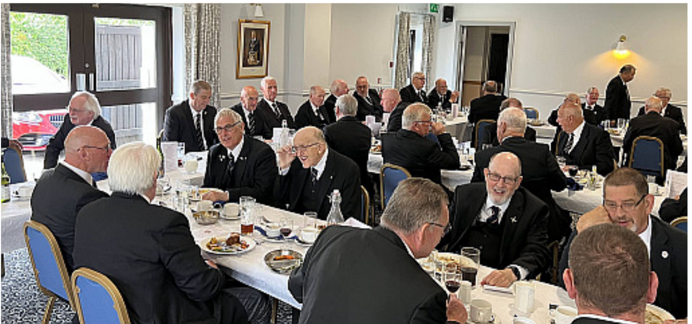
Time for some interesting chat between courses.