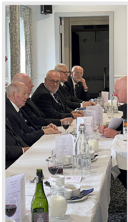
It's tough at the top (table)