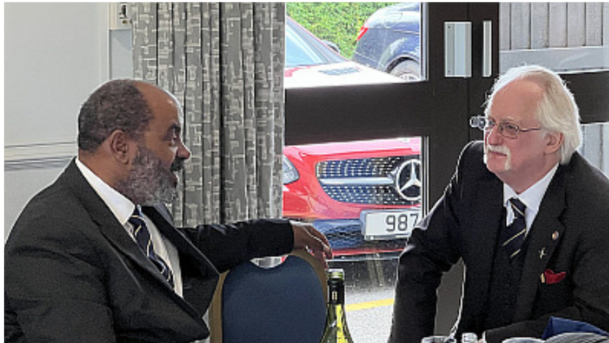
The new PGSR receives some friendly advice from the Asst GSR