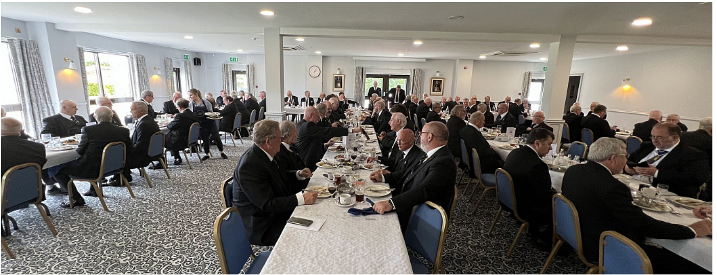
An excellent turnout for the Social Board