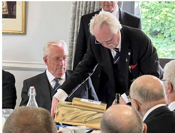
...makes a Presentation to the GSR...