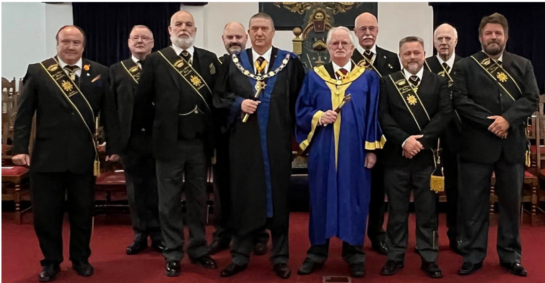
With the Grand Supreme Ruler's Arch of Steel