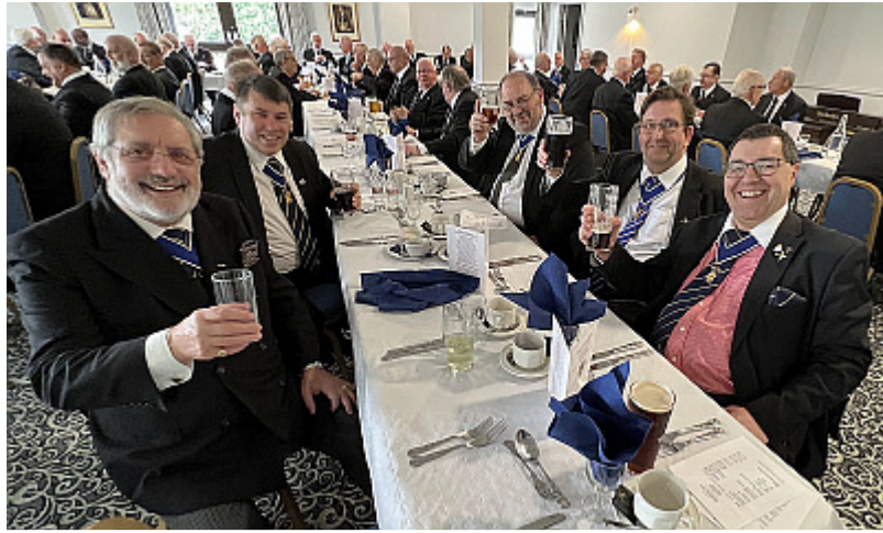
Members of the Arch of Steel awaiting a hearty meal.