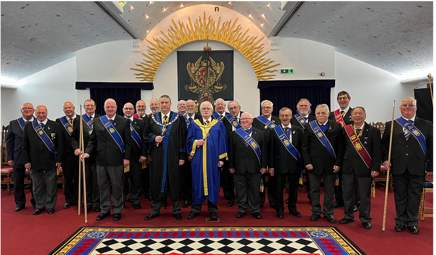
The New Provincial Team - looking happy!