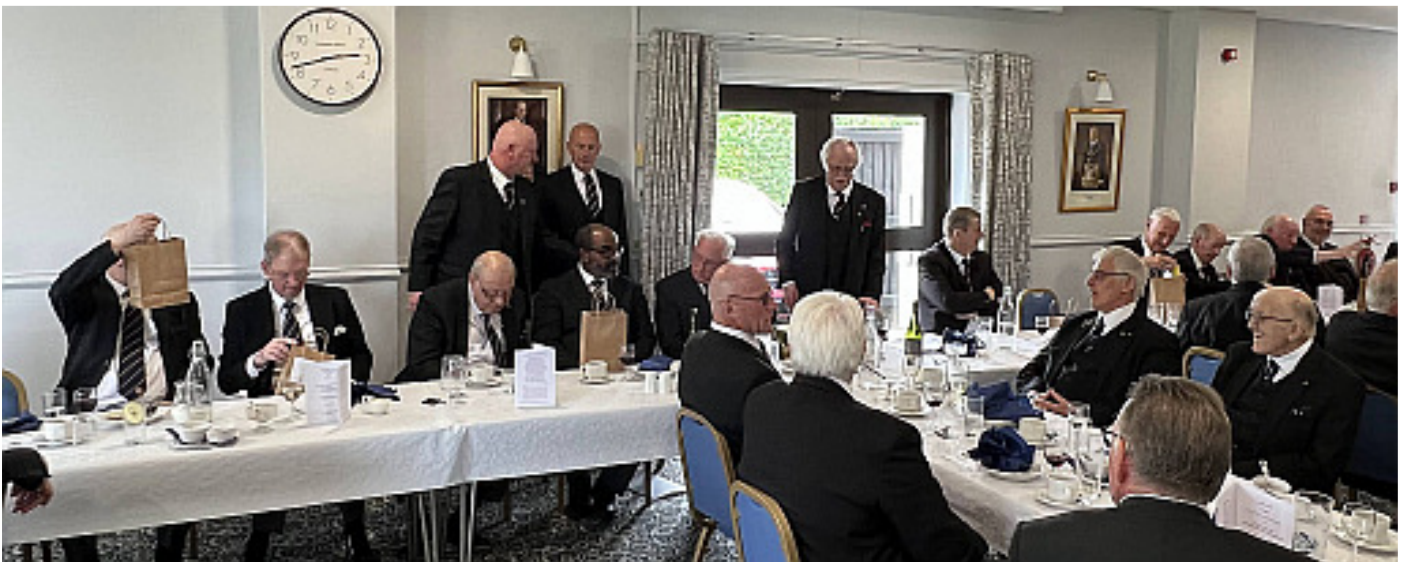
...and gives Party Bags to the Distinguished Guests.